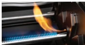
Instant, battery free JETFIRE™ 2.0 ignition