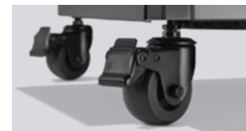
Caster wheels with 2 point leveling system