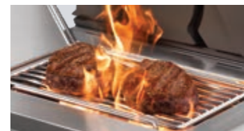
Infrared SIZZLE ZONE® side burner