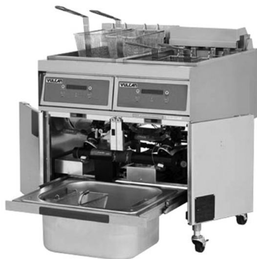
Model 2ER85DF Shown on casters (Accessory)