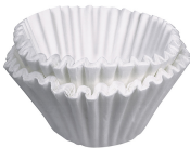
FILTERS,REG/1M Product #: 20115.6000